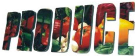
3-D Solutions Graphics With An Edge

We understand the need to add value to retail transactions by improving how information is obtained and relayed in the retail environment. We address this for our clients by creating exciting, unique and functional POP and merchandising materials.